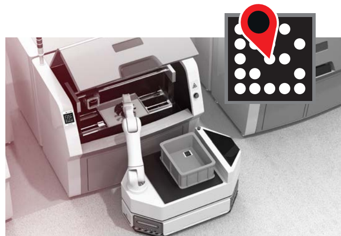
Target Mark technology enables easy identification and precise referencing of your mobile work stations.