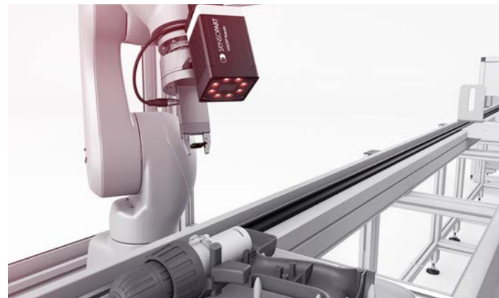
The VISOR® Robotic identifies the exact position of the cordless screwdriver. Offset data is used to correct the robot's trajectory.