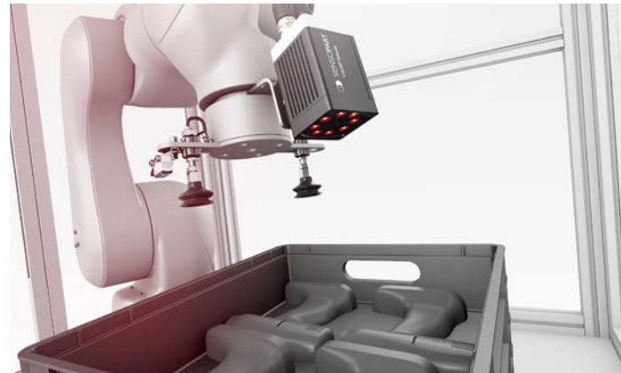
The position of components supplied in a tray can vary so strongly that robot guidance is necessary.